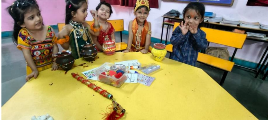
Rakhi Making Activity