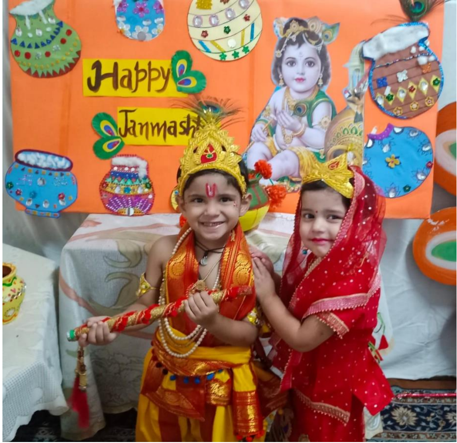
Matki Decoration Activity -